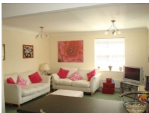
Sitting Room/Dining Room