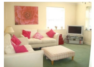
Sitting Room/Dining Room